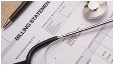
School of Revenue Cycle Management pages 4-5