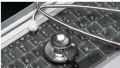
Customized Annual Education Programs pages 8-9