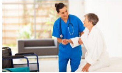
School of Long Term Care page 16