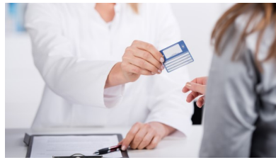
PFS/Business Office Certifications page 6