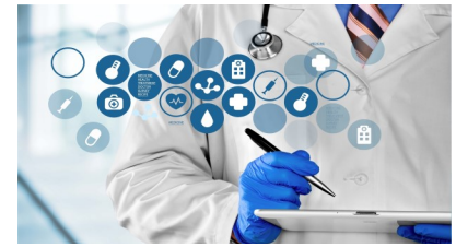
School of HIT and Healthcare Transformation page 7