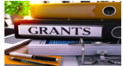
Grant and Other Program Resources page 17