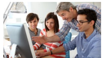
Student and Educator Program page 20